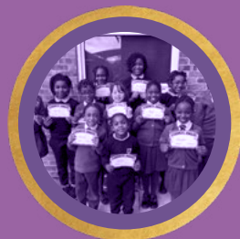
St Chad's Pupils St Chad's Primary School Kindness Ambassadors